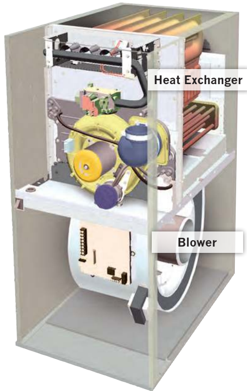
Comfort™ 95 Gas Furnace shown

Wi-Fi® is a registered trademark of the Wi-Fi Alliance Corporation.